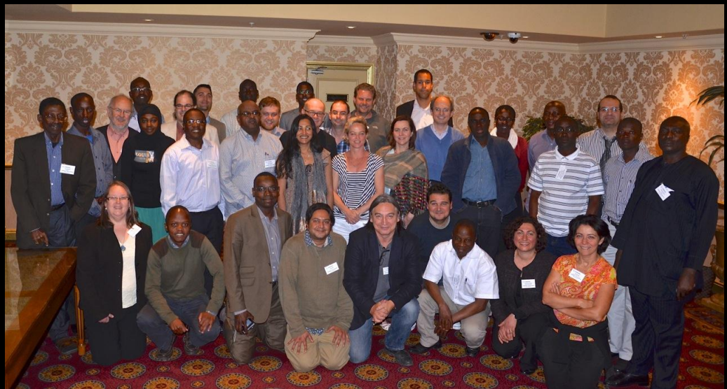
Group photo of H3ABioNet second annual meeting participants and SAB