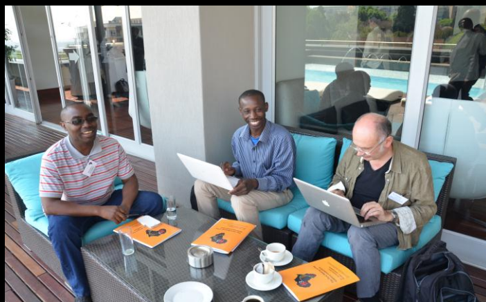
Slyvester, Pandam and Winston taking a break from interacting with the H3Africa consortium PIs and catching up on some email