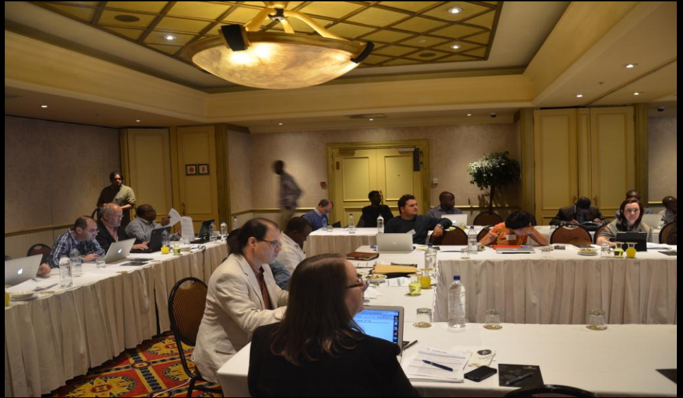
Day 2 of the second annual H3ABioNet meeting with the PIs and SAB